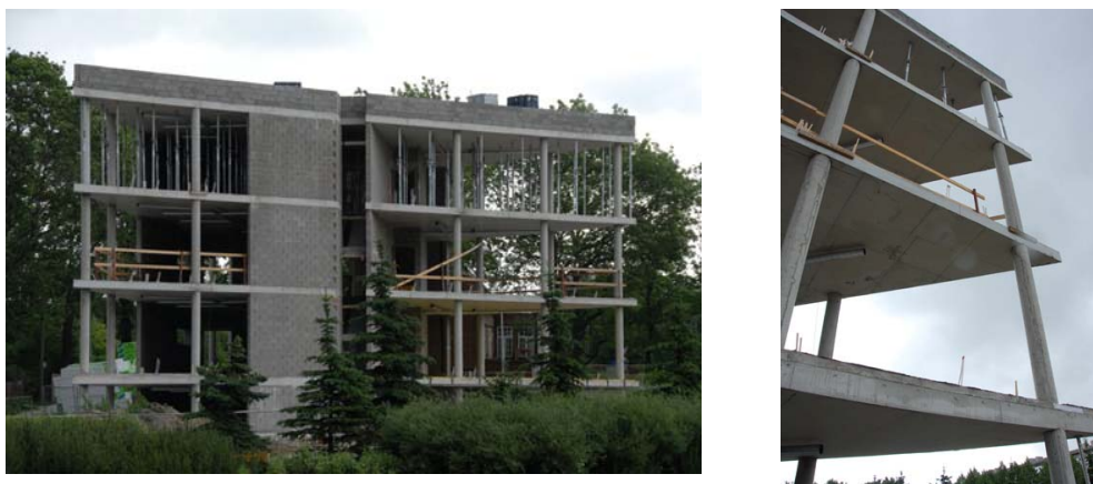
Fig. 5 Triangular office building in Tallinn, Estonia

By the end of 2006 a Triangular office building in Tallinn, Estonia was finished (see fig. 5). All four floors were constructed using TAB-Slab TM system; each floor has an area of 400 m 2 .