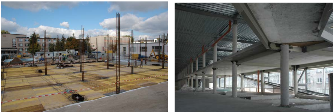
Fig. 4 Arcelor TAB-Slab TM system in shopping mall in Daugavpils, Latvia – floor above a cellar (left) and balcony (left)

So far the biggest continuous slab of 1020 m 2 was realized in a shopping mall “Ditton names” in Daugavpils, Latvia. This slab was cast above a cellar; its thickness is 24 cm and spans between columns of 6x6 m. The installation process on the formwork and concreting of the slab were finished in one day (see fig. 4). Since the construction was completed without any problem, the investor decided to cast two other slabs in this building, using the same technology – a balcony (see fig. 4.) and a slab on the first floor.