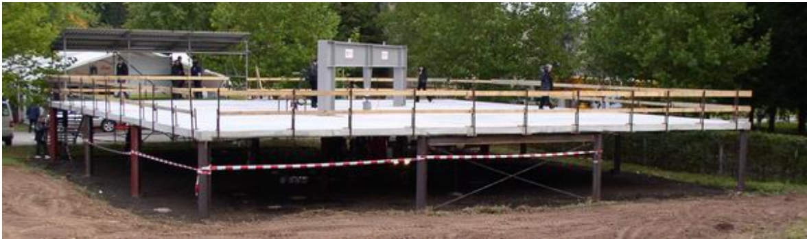
Fig. 2 Full-scale test of freely suspended elevated slab at ARCELOR Bissen – ULS test

APC rebars were tested by removing columns. When the force of the jack was down to zero, the measured settlements were as follows: 25 mm central, 37 mm edge and 35 mm corner column (see fig. 3 - left).