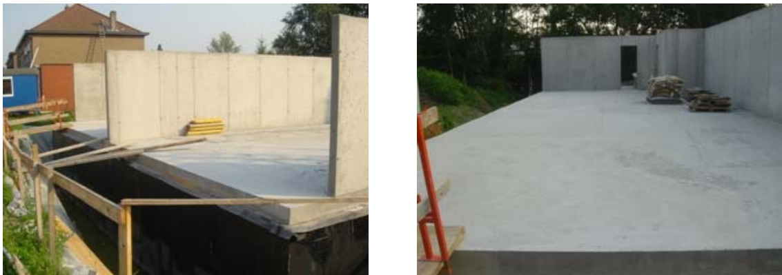
Fig. 6 Duffel, Belgium