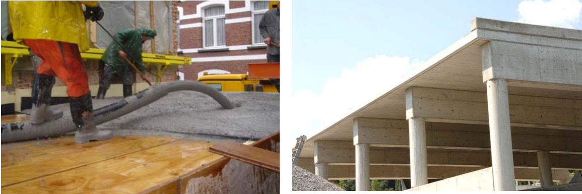
Fig. 5 Housing unit in Bruxelles, Belgium (left), Machinery Hall in Kössen, Austria (right)

Even though more than half of the projects were constructed in Baltic countries, the numbers of projects in Western Europe are also rapidly growing. Some of the projects are listed below.