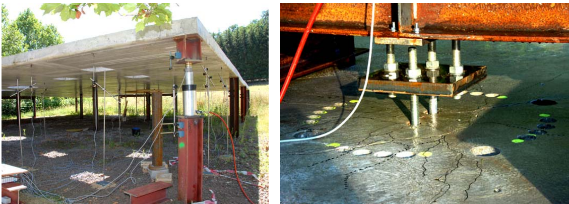
Fig. 3 Punching test – 60% of slab above central column cut out, no failure even at force of 600 kN (left), removing of corner column – max. settlement 35 mm (right)

As all tests were successful and they proved the previously supposed theories, it was possible to use this concept in practical applications.