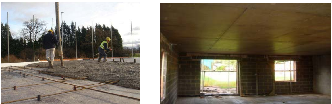
Fig. 6 Lier, Belgium