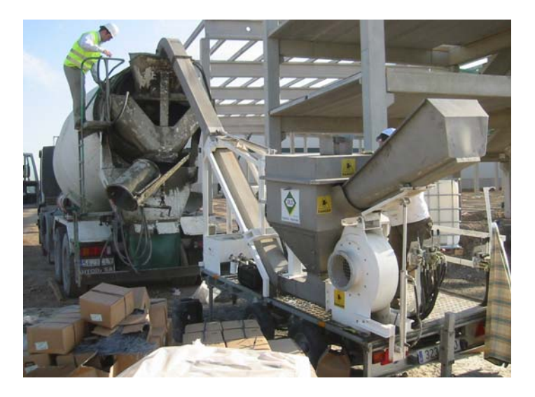
Fig. 4 Blast machine for dosing fibres by airflow