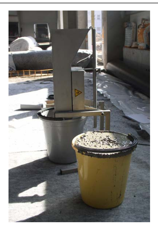
Fig. 1 The Dosometer and sample of concrete mixture before test