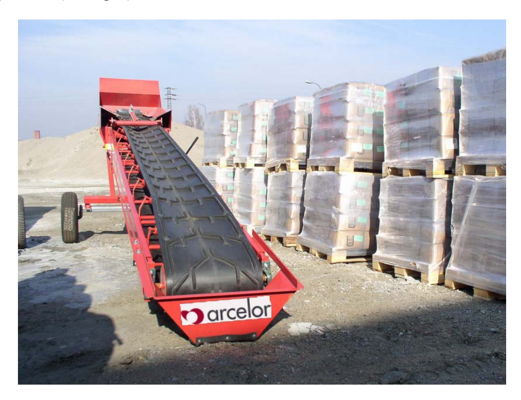
Fig. 3 Conveyor belt for dosing fibres

The above-mentioned results show, that it is not easy to achieve uniform distribution of fibres, not even at laboratory conditions. Results are influenced by many factors. First of all, it is way of dosing fibres. It is probable, that considerably better results could be achieved if a blast machine (a dosing equipment which uses a air flow to move fibres in a mixer) is used (see Fig. 4).